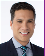
Reggie Aqui ABC7 Mornings Anchor